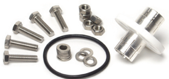
Flanged coupling kit