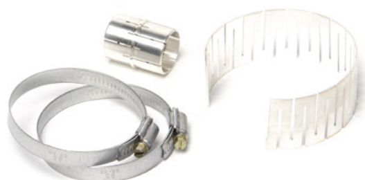
Unflanged coupling kit