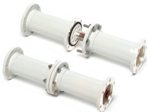
Flanged coupling kit put together